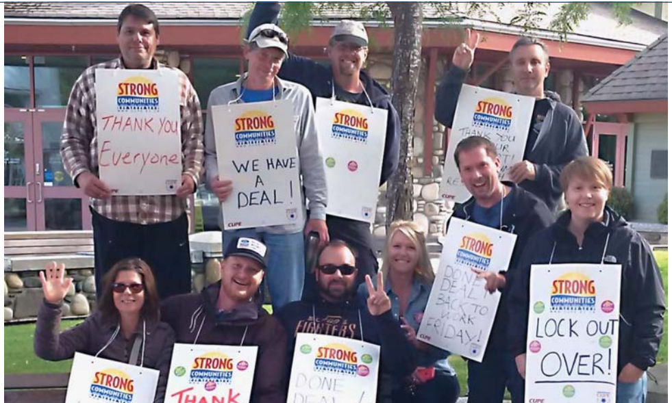
BACK TO WORK Members of CUPE 401 celebrate after the end of the five-week lockout, thanking other CUPE and union members who stood with them.