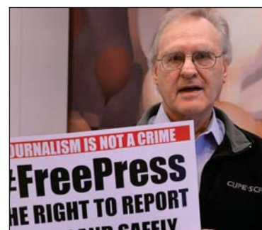
JUSTICE SEEKER Stephen Lewis described the Prime Minister's Office under Stephen Harper as "retrograde, reactionary, fossilized...a kind of autocratic narcissism run rampant."